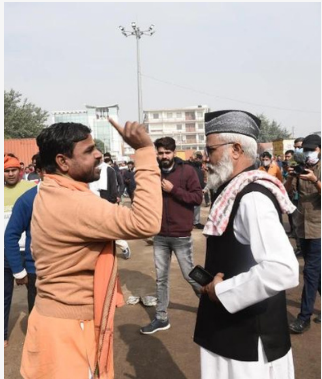
A HINDU VIGILANTE TRIES TO STOP AN IMAM FROM OFFERING PRAYERS AT SECTOR 37 IN GURUGRAM NEAR NEW DELHI

In addition to having the courts support the destruction of mosques, access to prayer space has also become increasingly difficult for Indian Muslims.